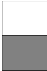
Half Page Horizontal 7 3/4" x 5"